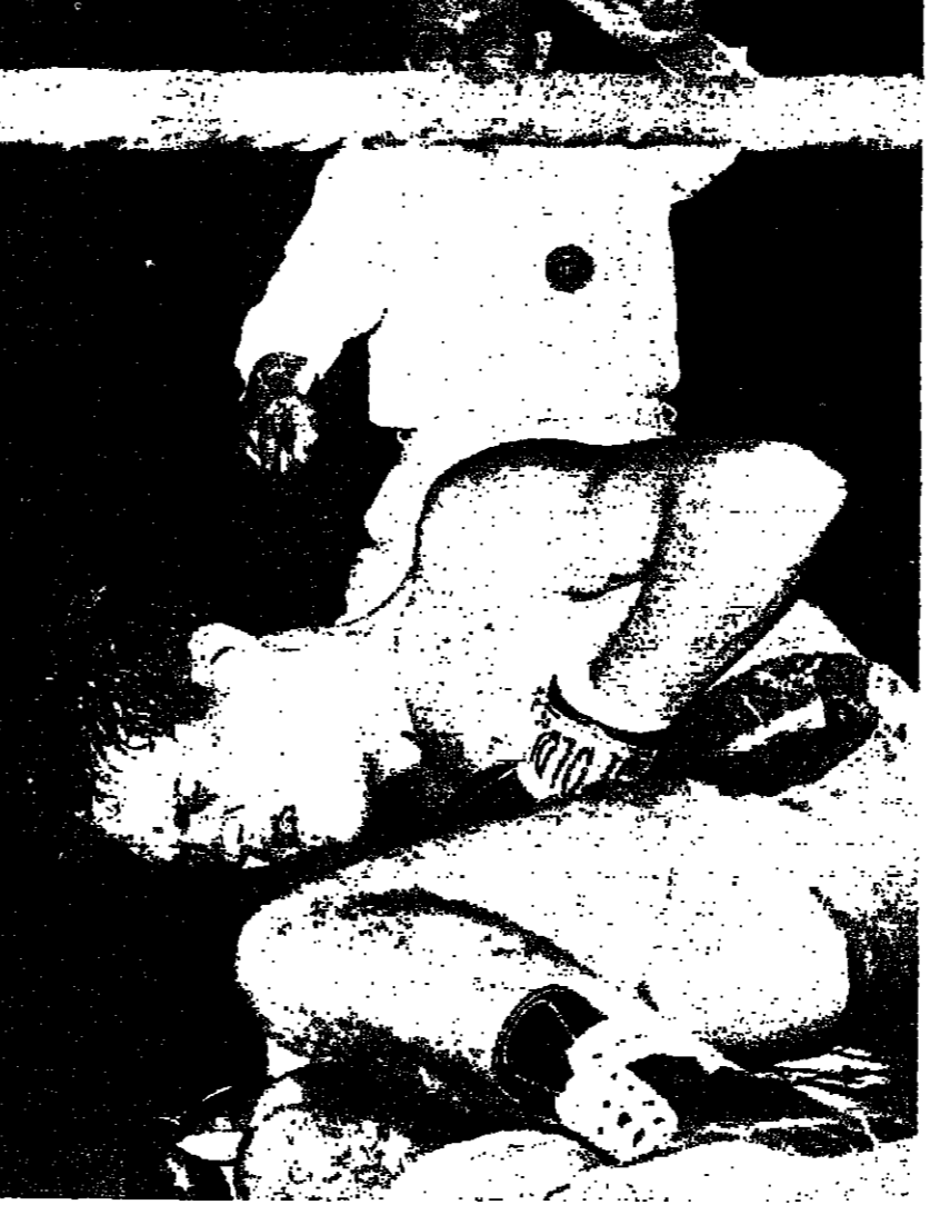
Serious bodily injury and concussion are common in boxing.

The art of training The cardinal determinant of performance is training. Innate ability, of course, is also necessary, but no sportsman ever excelled without hard training. Even today, training is an art; some coaches and athletes master it by intuition, some by trial and error.